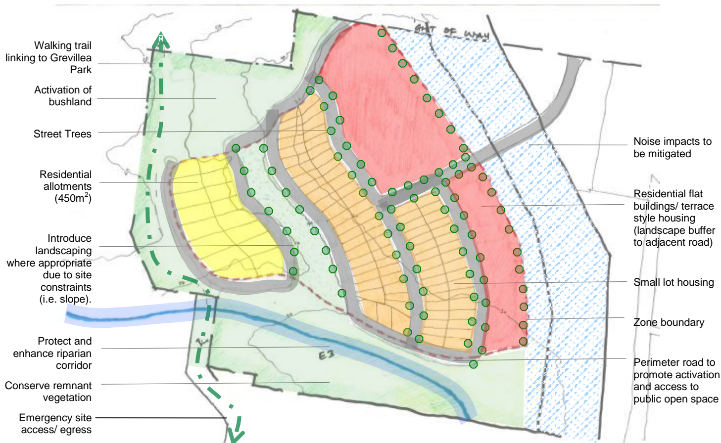
Figure 5.1 Bulli Brickworks Master Plan

The Bulli Brickworks Master Plan has been prepared to demonstrate the key principles guiding the future development of the site and to establish an estimated dwelling yield. Any future development applications for small lot housing, earthworks, road design etc are to demonstrate how these key principles have been considered and achieved.