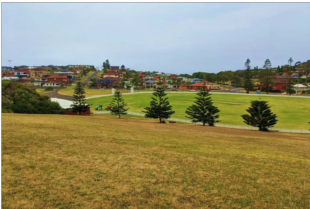
Figure 1: Site photograph