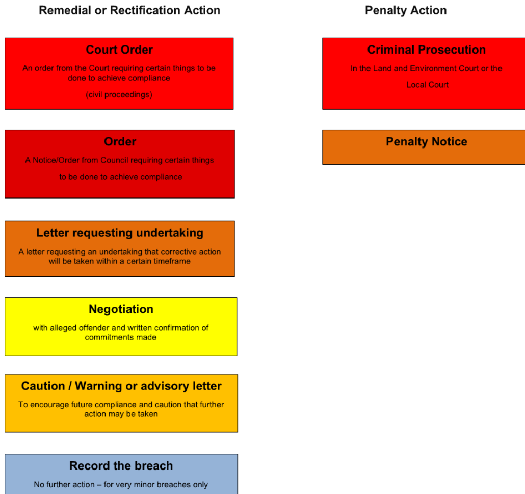
Figure 1: Enforcement actions available to Council

Note that it may be appropriate to use more than one enforcement option in some cases. If initial enforcement action does not achieve a satisfactory outcome, it may be necessary to proceed to a higher level of enforcement response. For example, if a warning letter or notice of intention does not achieve the desired response, it may be appropriate to give an Order; or if an Order is not complied with, it may be appropriate to bring enforcement or prosecution proceedings.