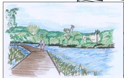
VIEW ALONG TOWRADGI CREEK

PROPOSED PLANTING LIST FEATURE TREE PLANTING ARAUCARIA HETEROPHYLLA - FORESHORE FICUS RUBIGINOSA - TOURIST PARK ENTRY OVAL PERIMETER PLANTING CUPANOPSIS ANACARDIODES FORESHORE WINDBREAK SHADE BANKSIA INTEGRIFOLIA LEPTOSPERMUM LAEVIGATUM SHADE TREES ACMENA SMITHII BANKSIA INTEGRIFOLIA EUCALYPTUS BOTRYOIDES EUCALYPTUS ROBUSTA GLOCHIDION FERDINANDII MELALEUCA LINARIFOLIA NOTELA VENOSA RIPARIAN PLANTING / BUFFER STRIP ACACIA LONGIFOLIA VAR. SOPHORAE COMMERSOIA FRASERI COMMELINA CYANEA CASUARINA GLAUCA FICUS CORONATA LOMANDRA LONGIFOLIA TREMIA TOMENTOSUM VAR. VIRIDIS