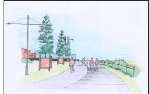
TOWRADGI BEACH PARK WITH TIMBER BOARDWALK