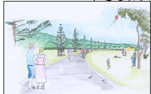
VIEW LOOKING NORTH TO SLSC SHOWING NEW SHARED PATHWAY