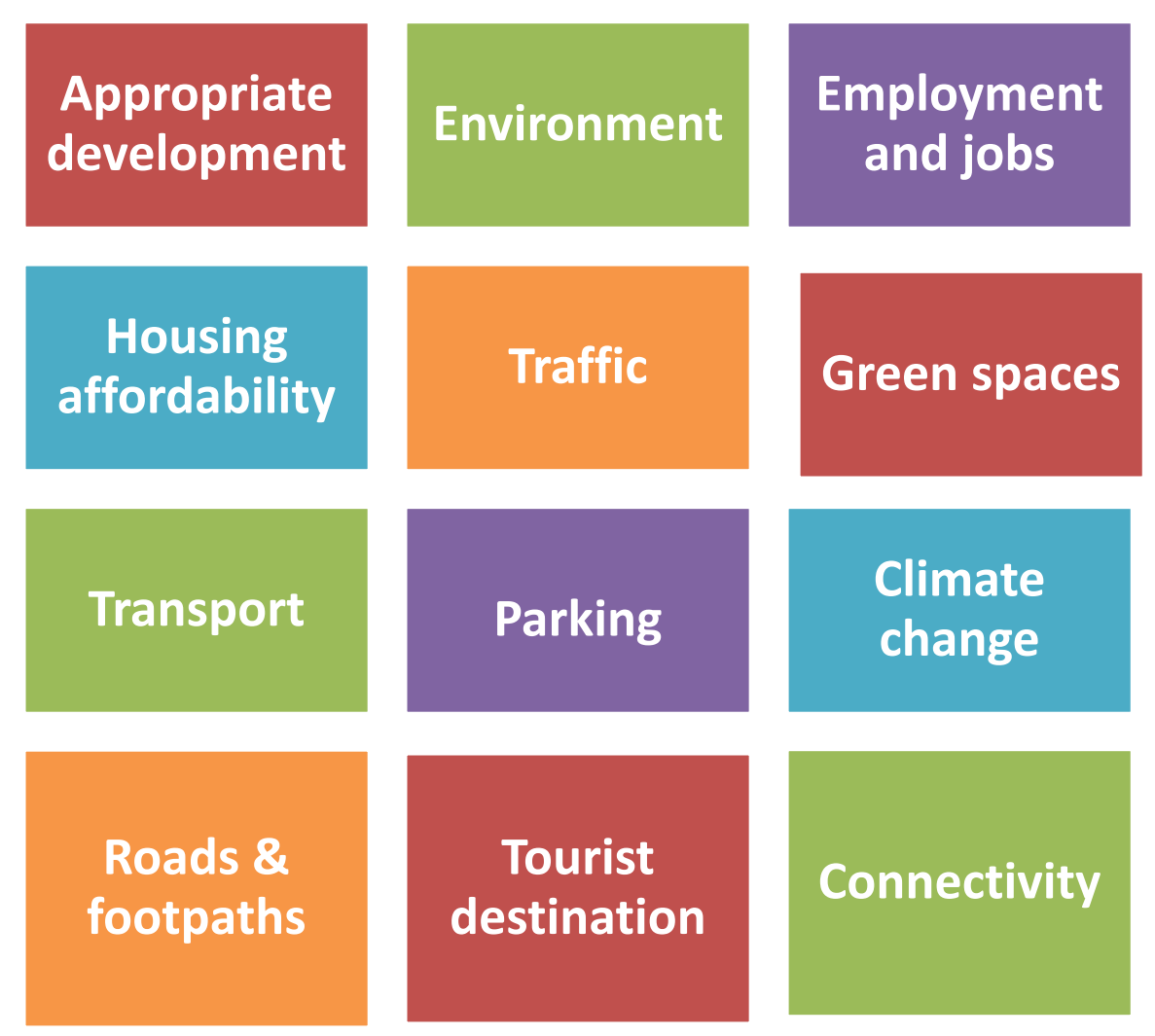
Diagram 2: Key Themes from Engagement – Our Wollongong 2028 Discussion Paper

An overview of the major themes that came through the engagement process are presented below (Diagram 2).