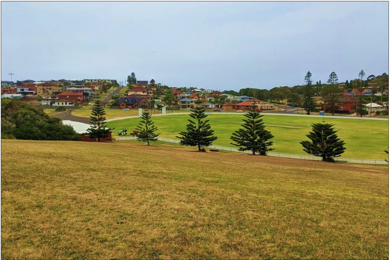
Figure 1: Site photograph