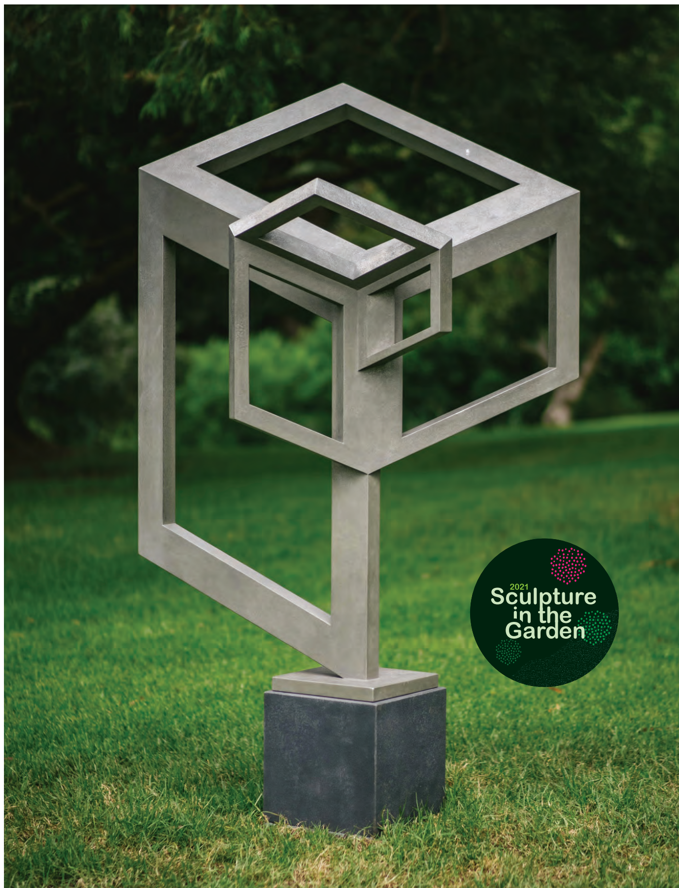
Image: Fatih Semiz, Curious Dream of an Architect . Wollongong Botanic Garden