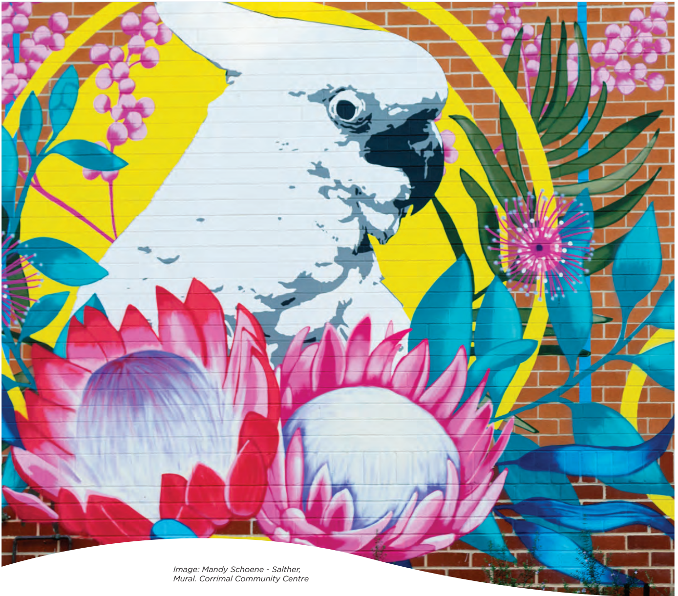
Mural. Corrimal Community Centre