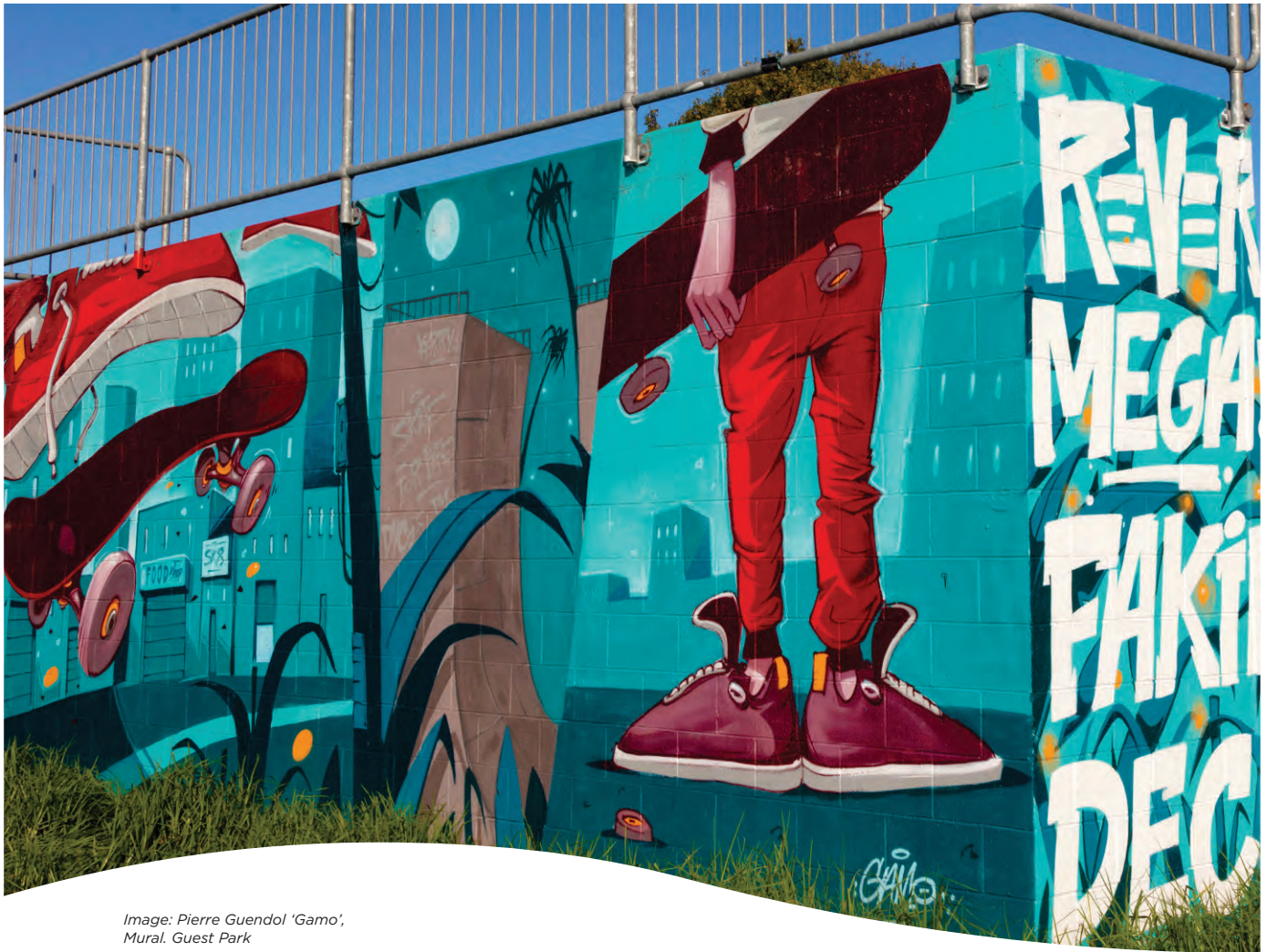
'Gamo', Mural, Guest Park