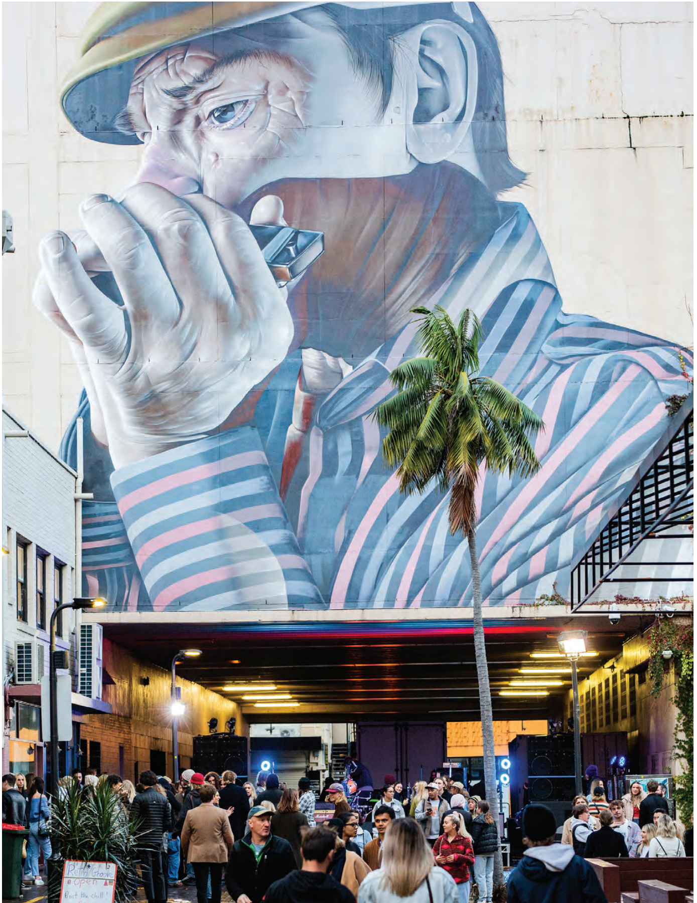
Image: Smug One, Mural. Wonderwalls 2017, Full set Festival. Globe Lane Wollongong