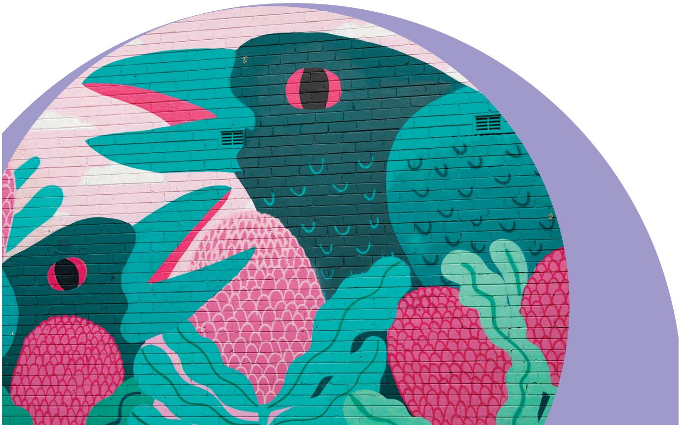
Mural, Fairy Meadow

Art by its nature is subjective and in a diverse community, cannot appeal to all people, nor should it be expected to do so. This is equally true for public art. As our community and modes of expression evolve, so will our definitions of what public art is and can be. Over time, materials and methods change to reflect our contemporary culture and can, at times, cause controversy. A variety of opinions is inevitable, and a strong sign of a healthy, open, and engaged community.