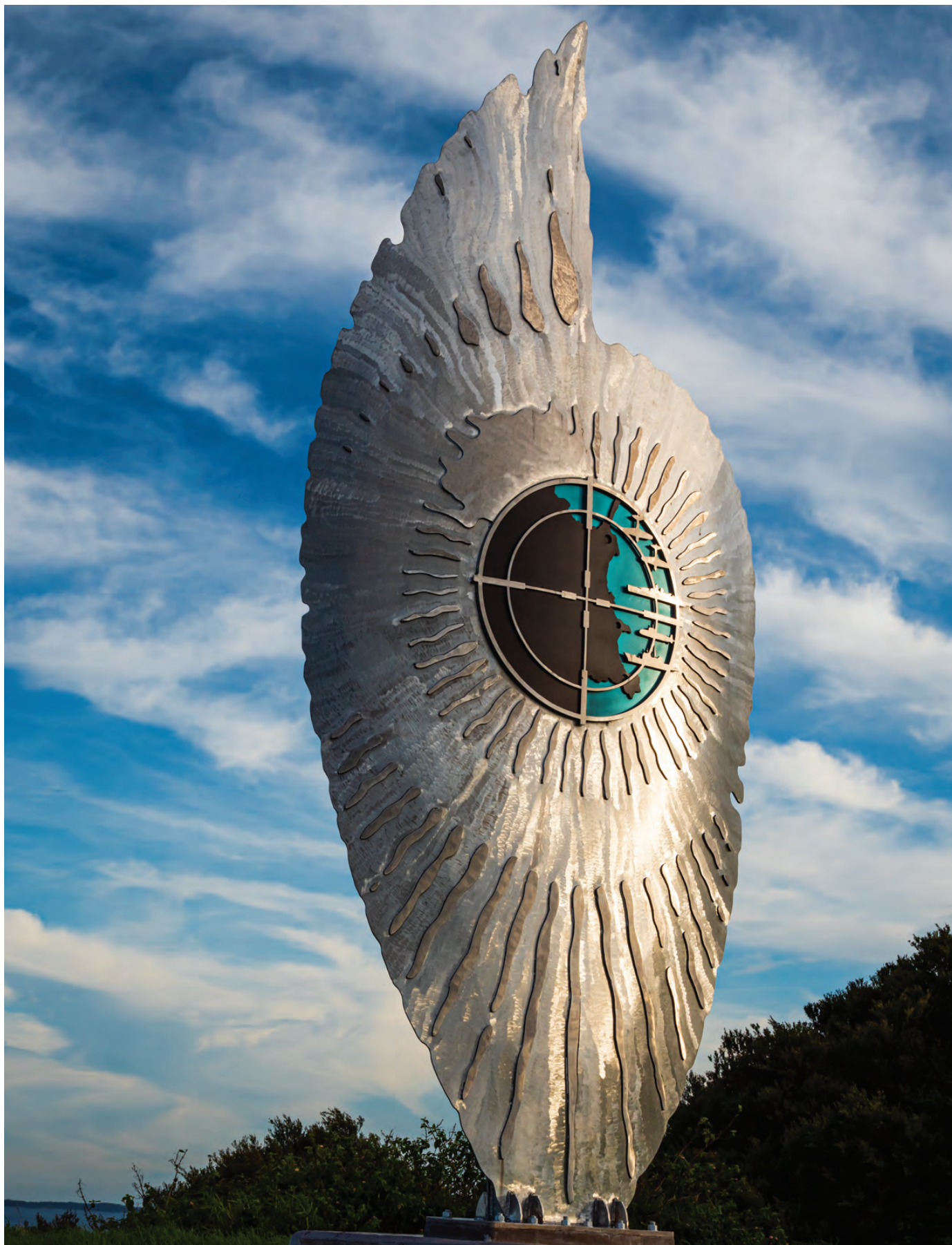
Eye on the Horizon. Hill 60 Reserve