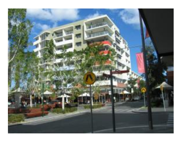
Figure 5: Mixed use development containing active ground floor retail shops and café / restaurants with upper level residential apartments