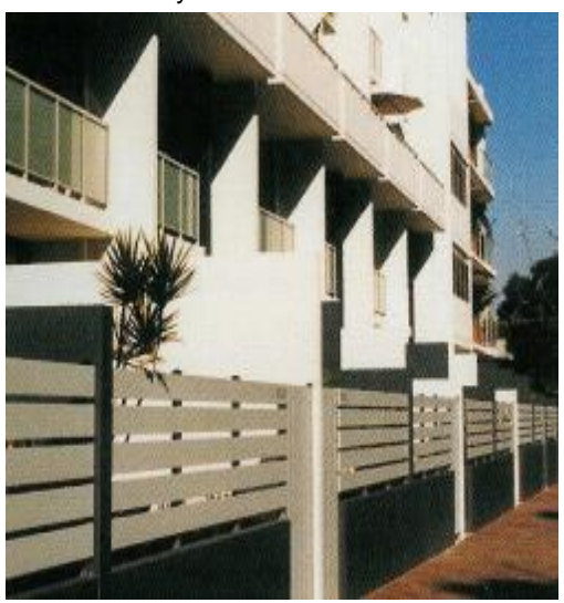
Figure 2: Ground floor residential units with residential entrances directly accessed from the street (Ref: Residential Flat Design Code)