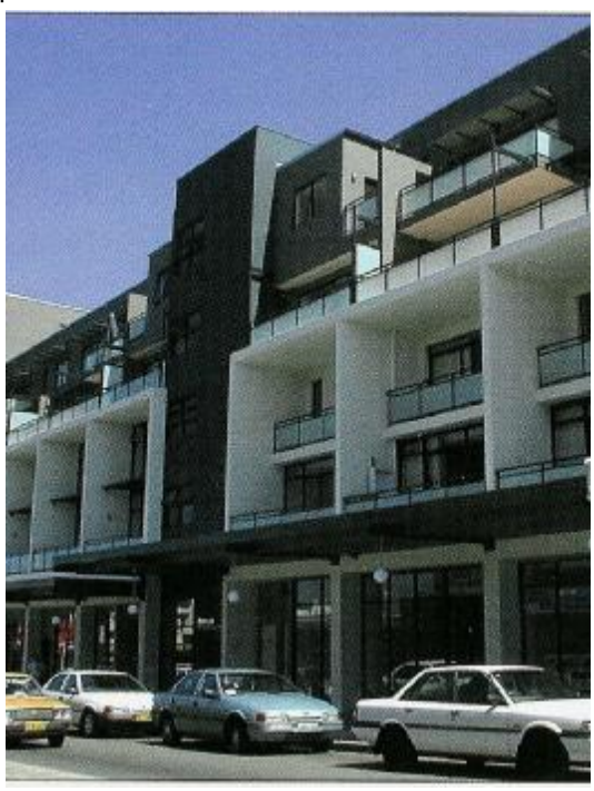
Figure 1: Provides a continuous facade along main commercial streets at the lower levels (Ref: Residential Flat Design Code