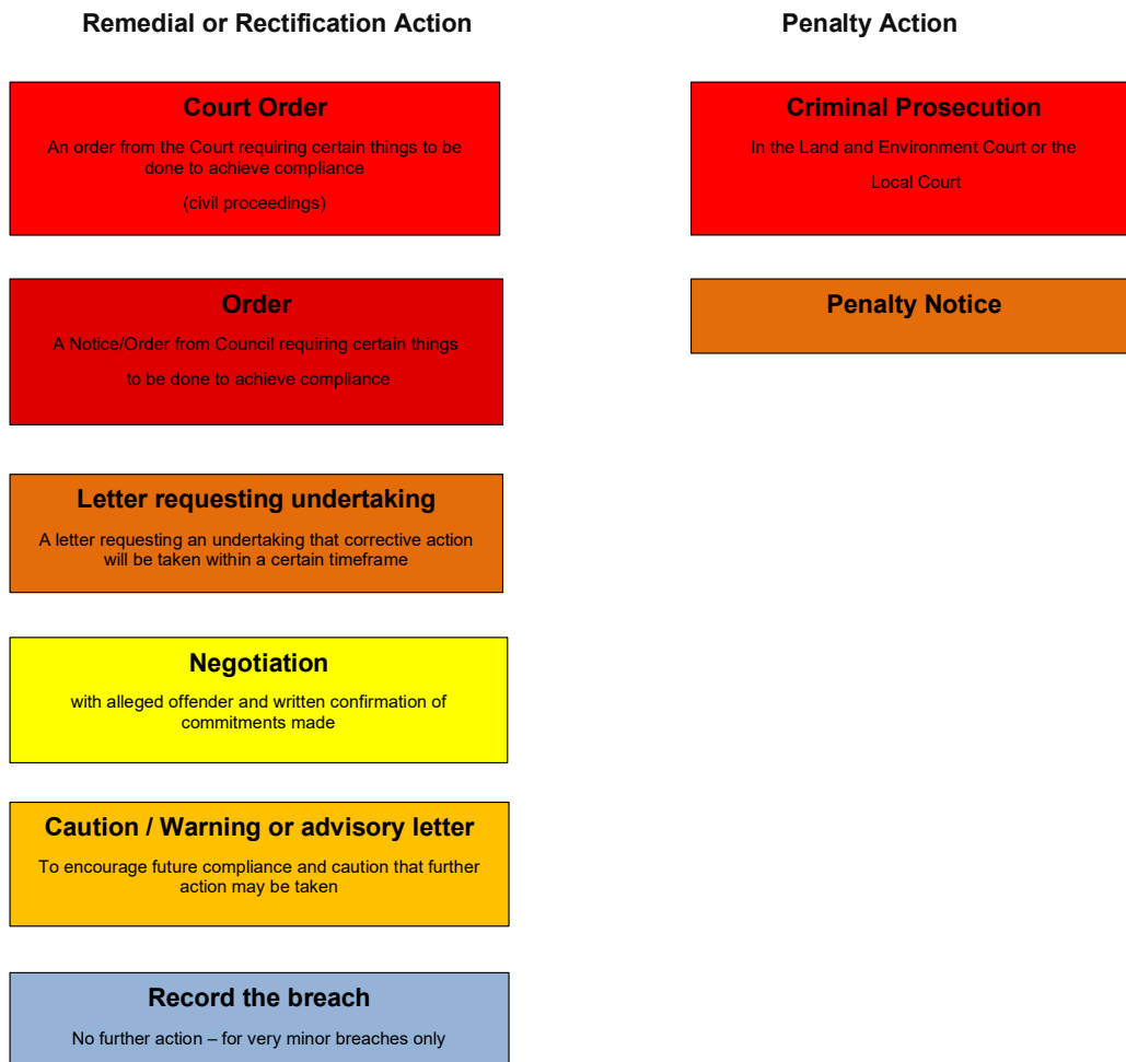
Figure 1: Enforcement actions available to Council

Note that it may be appropriate to use more than one enforcement option in some cases. If initial enforcement action does not achieve a satisfactory outcome, it may be necessary to proceed to a higher level of enforcement response. For example, if a warning letter or notice of intention does not achieve the desired response, it may be appropriate to give an Order; or if an Order is not complied with, it may be appropriate to bring enforcement or prosecution proceedings.