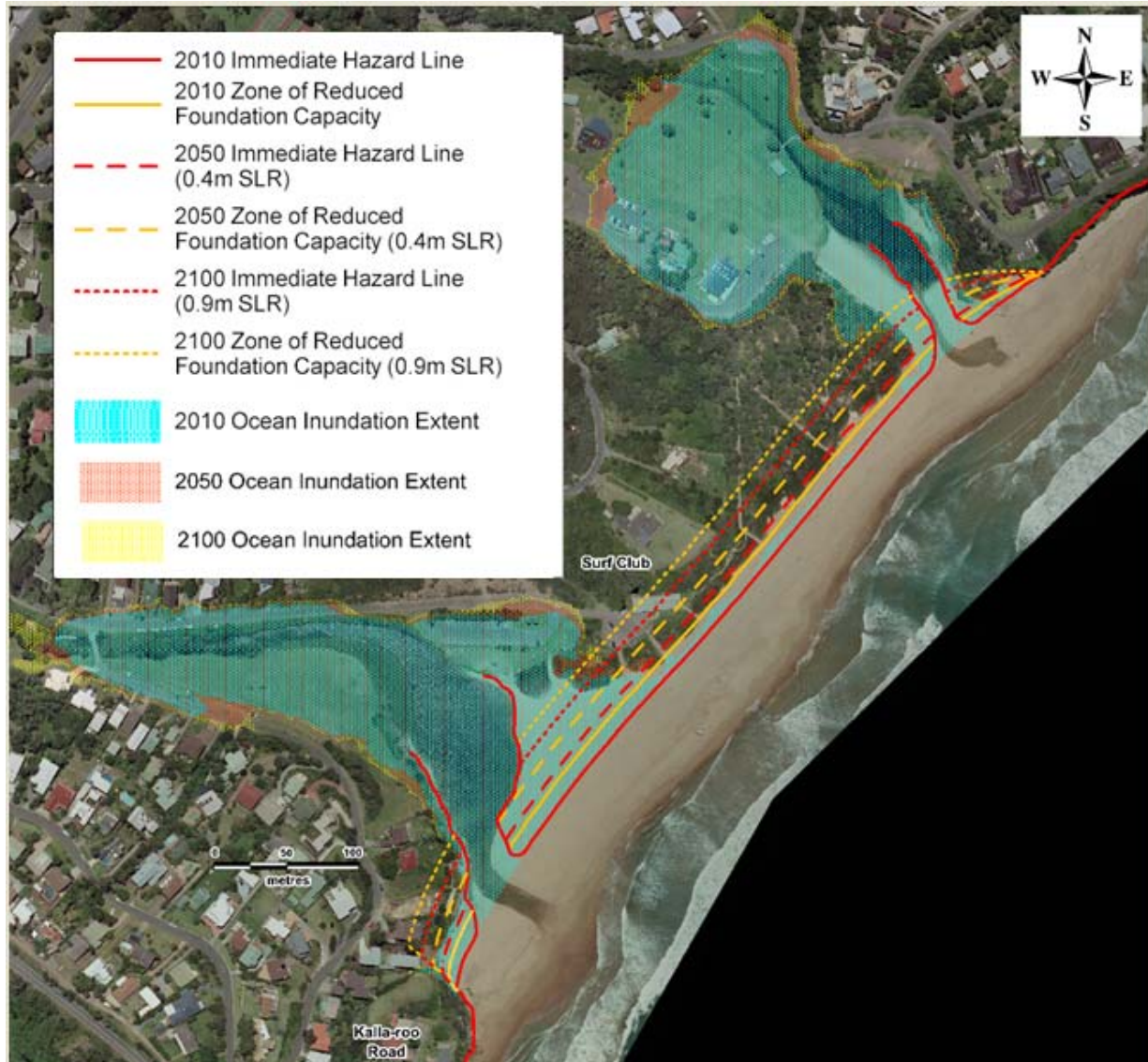
Figure ES1: Erosion and Inundation Hazard Mapping at Stanwell Park Beach