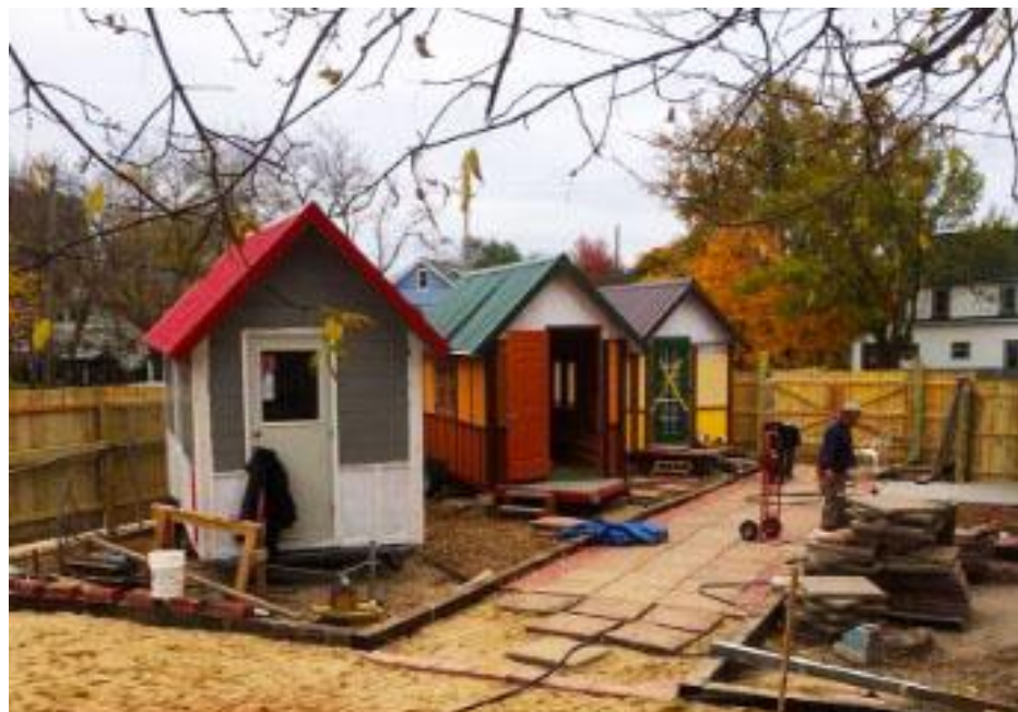
Tiny houses (Occupy Madison)