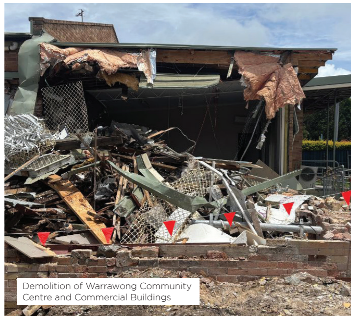
Demolition of Warrawong Community Centre and Commercial Buildings

To see where we'll be working visit wollongong.nsw.gov.au/current-works or keep an eye out for our onsite signage to learn more about a project.