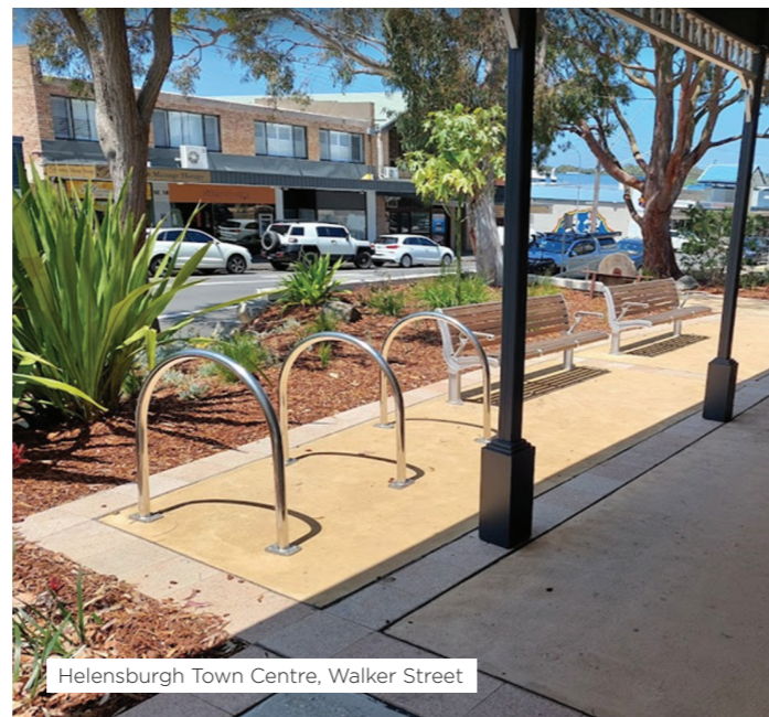
Helensburgh Town Centre, Walker Street