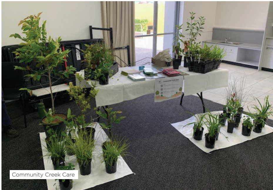
Community Creek Care