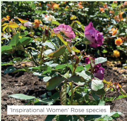
'Inspirational Women' Rose species