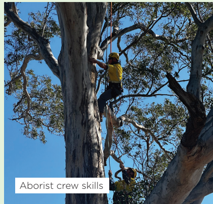
Arborist crew skills