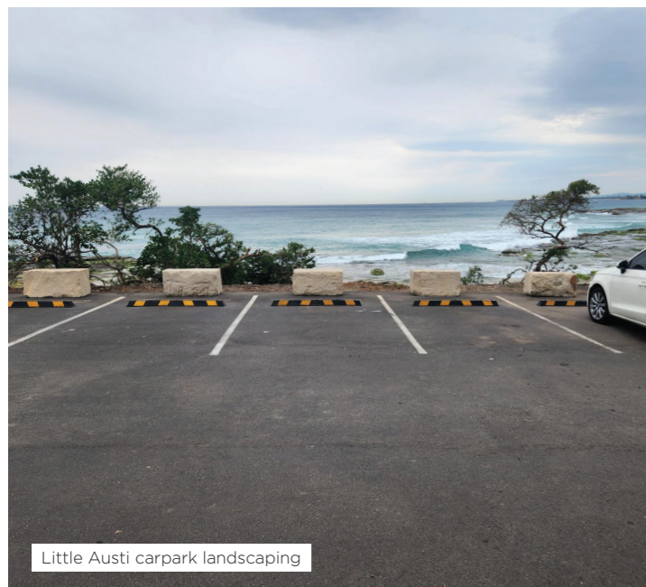
Little Austi carpark landscaping