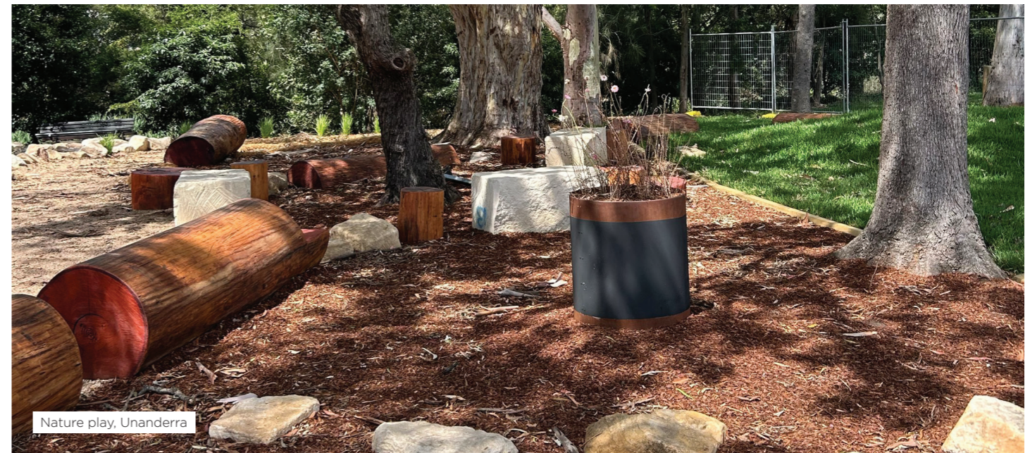
Nature play, Unanderra