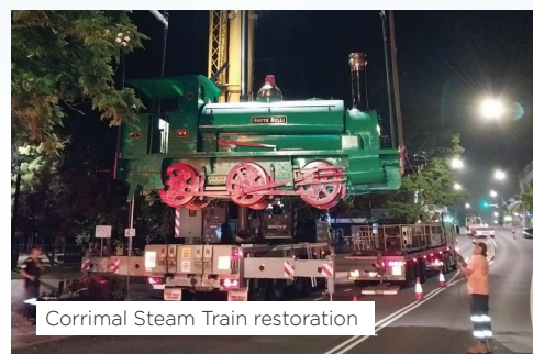
Corrimal Steam Train restoration