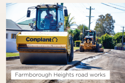
Farmborough Heights road works

Every day, we do various jobs to maintain our roads and footpaths. One of the big jobs we've completed was the road resurfacing at Farmborough Road, Farmborough Heights. It took a number of weeks to complete, using a range of different machines. The line-marking along Farmborough Rd has now been completed. We delay line-marking for at least 2 weeks on all projects to allow the pavement to cure.