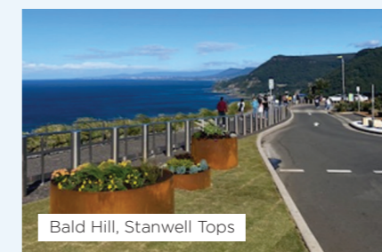
Bald Hill, Stanwell Tops

We also ask you do not dump illegally. There's plenty of options to get rid of your waste wisely that considers our community and environment. Visit our website for more info wollongong.nsw.gov.au/waste