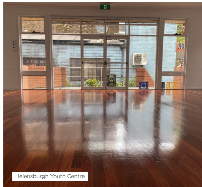
Helensburgh Youth Centre