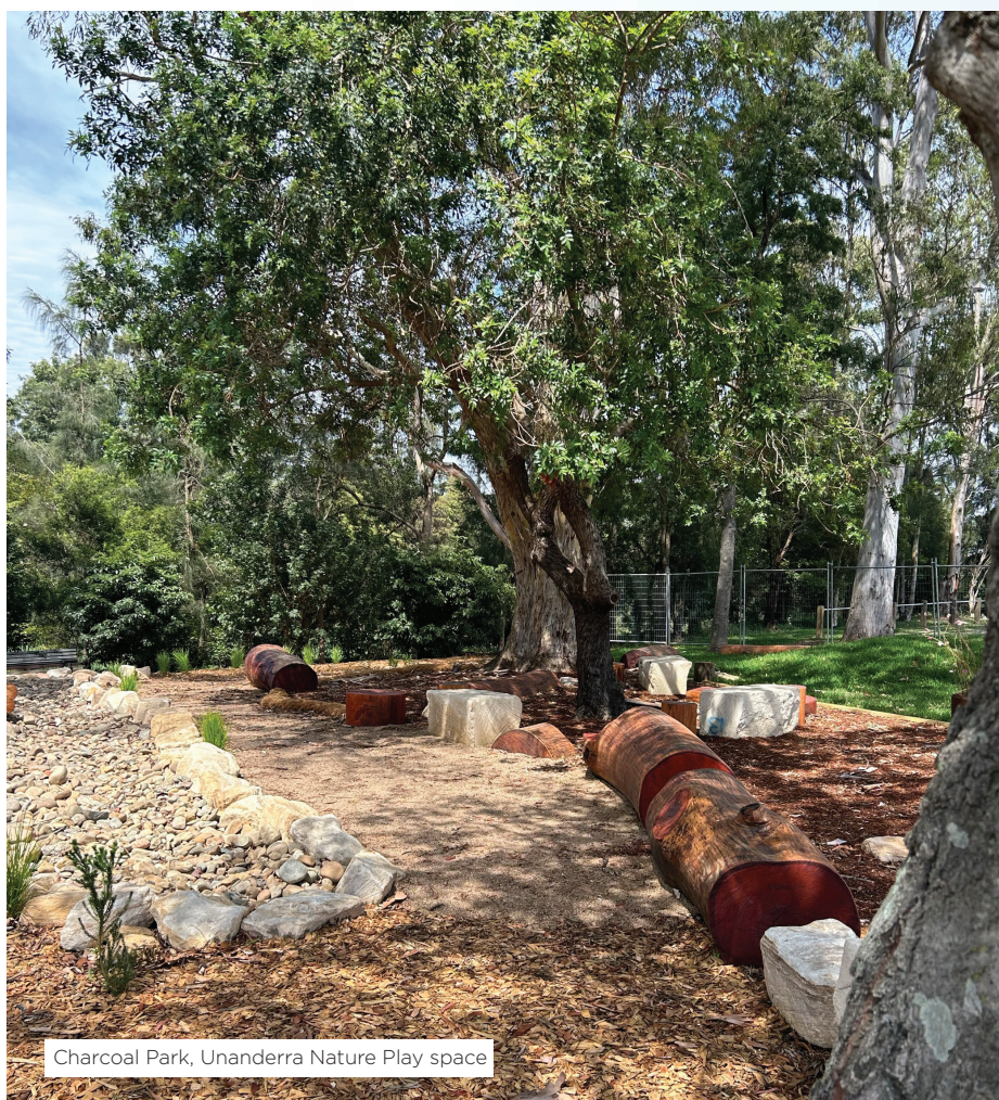
Charcoal Park, Unanderra Nature Play space