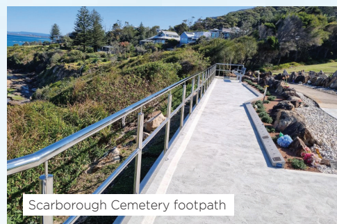
Scarborough Cemetery footpath