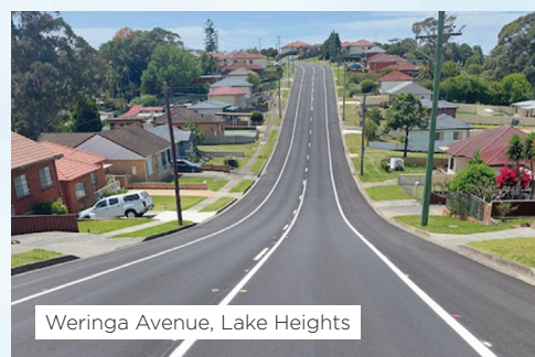
Weringa Avenue, Lake Heights