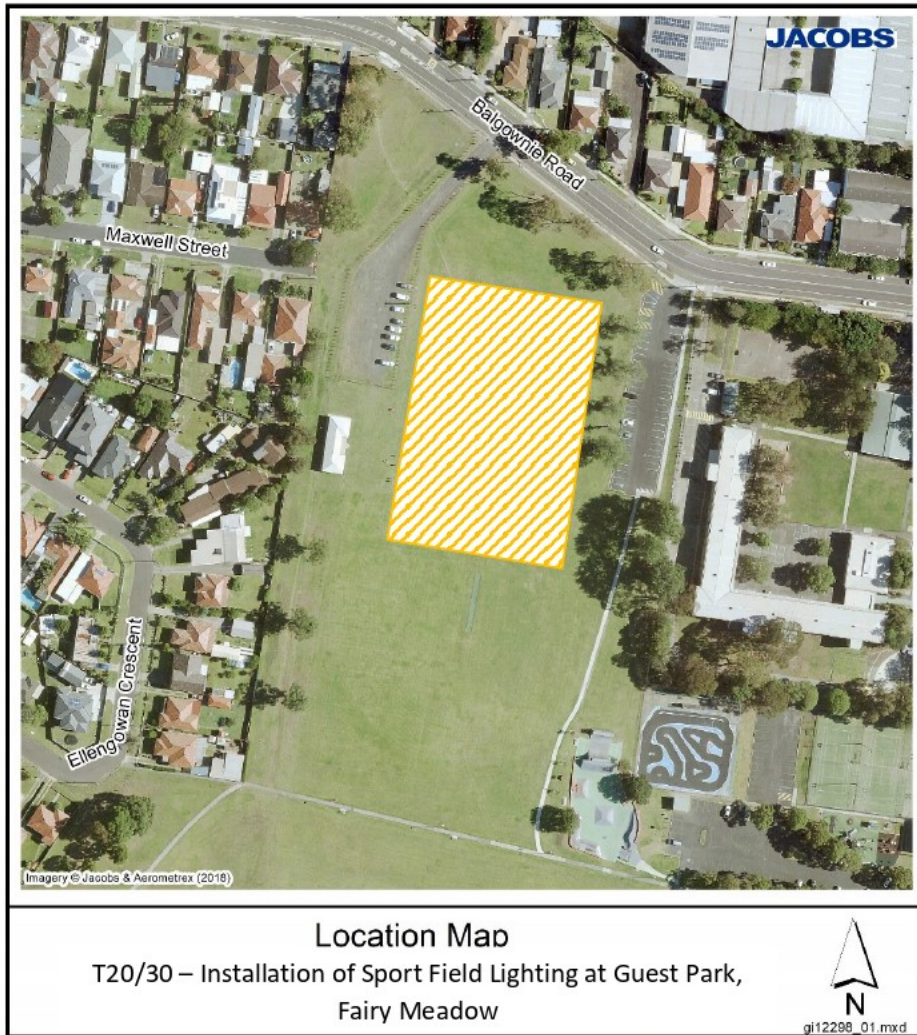
Location Map T20/30 – Installation of Sport Field Lighting at Guest Park, Fairy Meadow