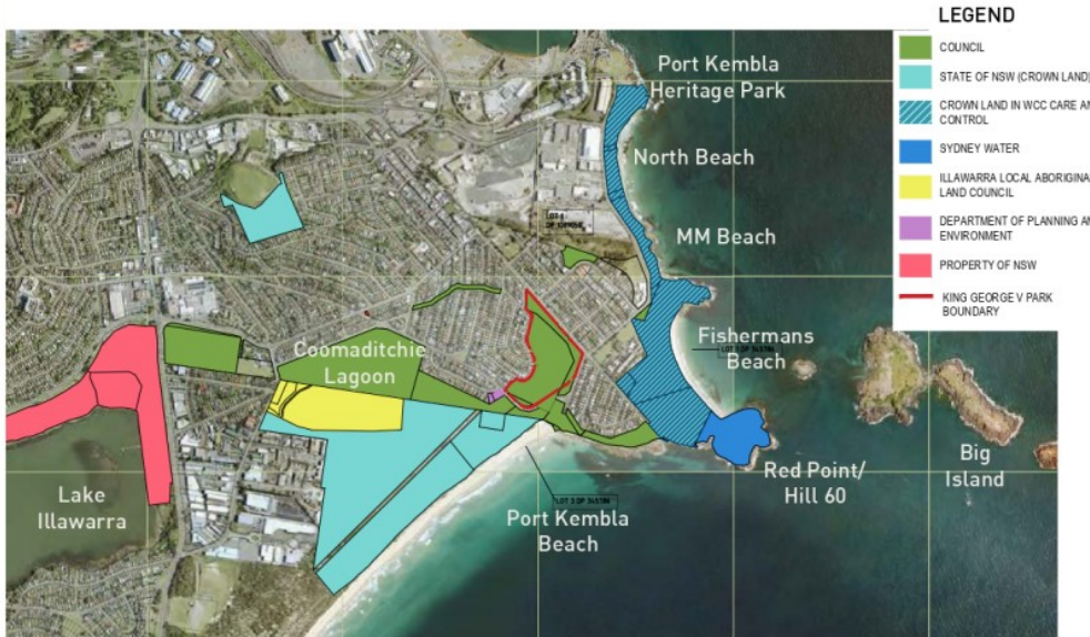
OPEN SPACE LAND OWNERSHIP