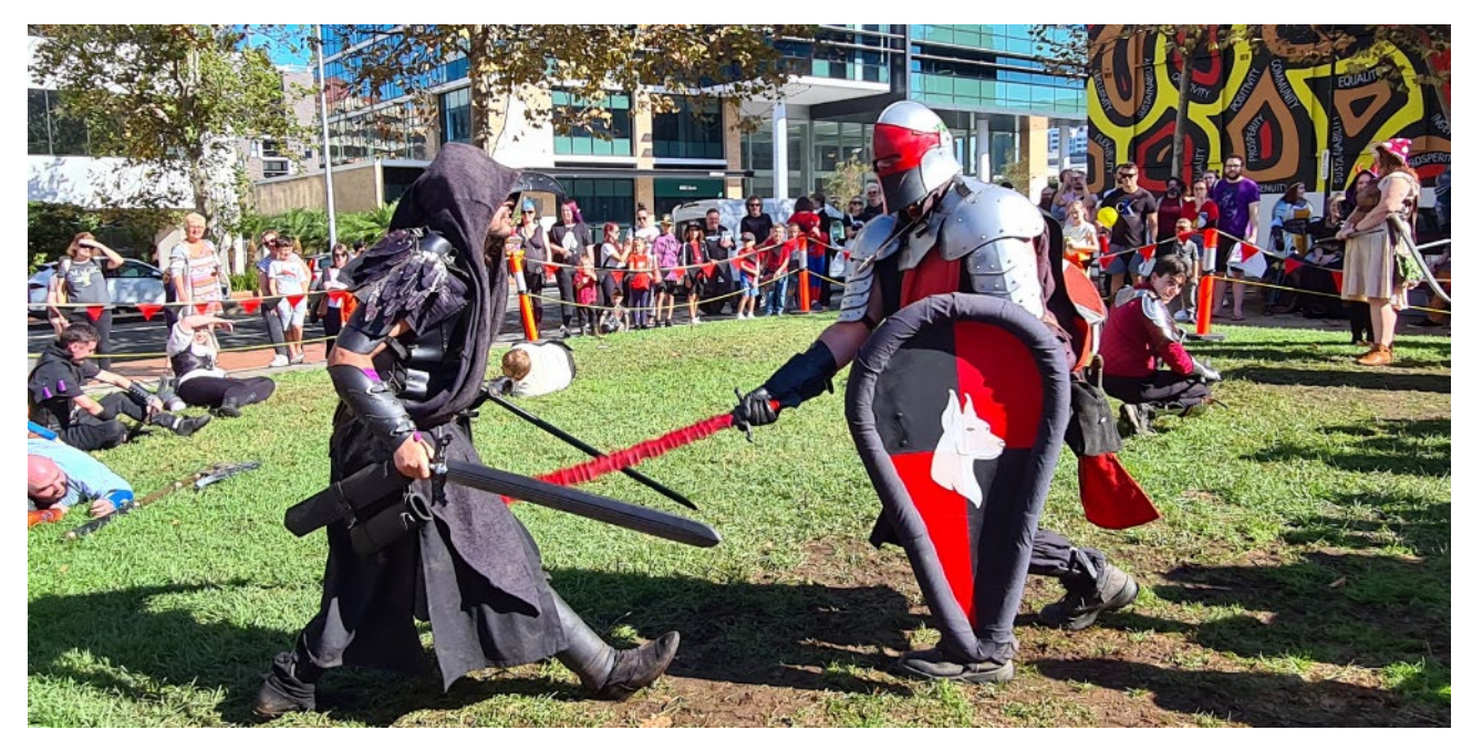
[IMAGE: Battle Cry Live Action Role Players demonstrate swordplay at Comic Gong 2022]

The familiar cosplay competitions, face painters, arcade alley, board games, children's activities and local Lego robotics group, Project Bucephalus , were welcomed by Comic Gong regulars. A new legion of fans were entertained by the Superman Stunt show in the Arts Precinct, Battle Cry LARP (Live Action Role Playing) and later at the after party, the Steampunk Vagabonds with their pirate dancing. Over 12,000 people attended Comic Gong.