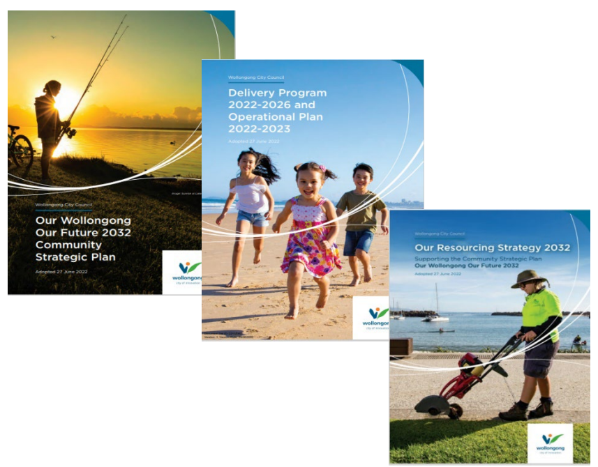
IMAGE: Our Wollongong Our Future 2032 Integrated Planning and Reporting Document Suite

During the June 2022 quarter, finalisation of the Our Wollongong Our Future 2032 Integrated Planning and Reporting document suite was completed and adopted by Council. This significant project included the development of a new Community Strategic Plan, four year Delivery Program 2022-2026 and one year Operational Plan 2022-2023 and the Resourcing Strategy.