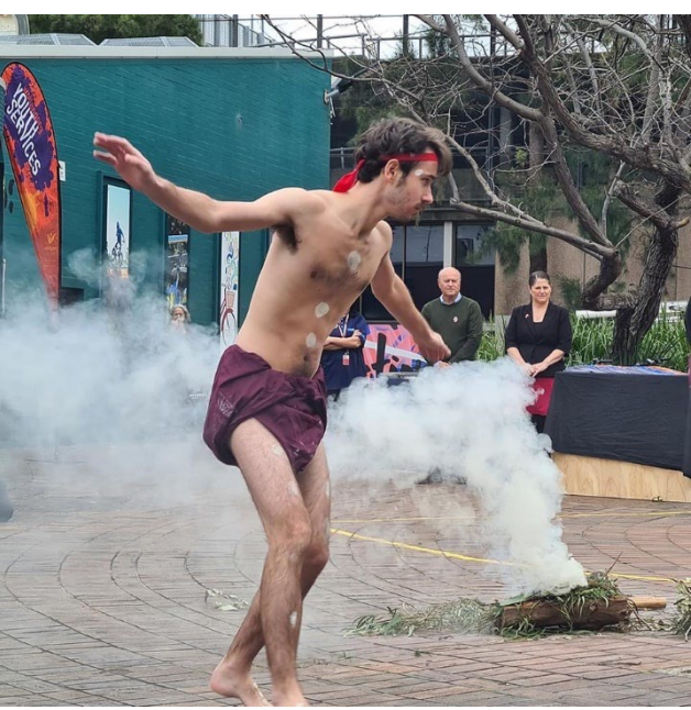
[IMAGE: Welcome to Country Smoking Ceremony at the Wollongong Youth Centre, as part of NAIDOC Week, 2022]