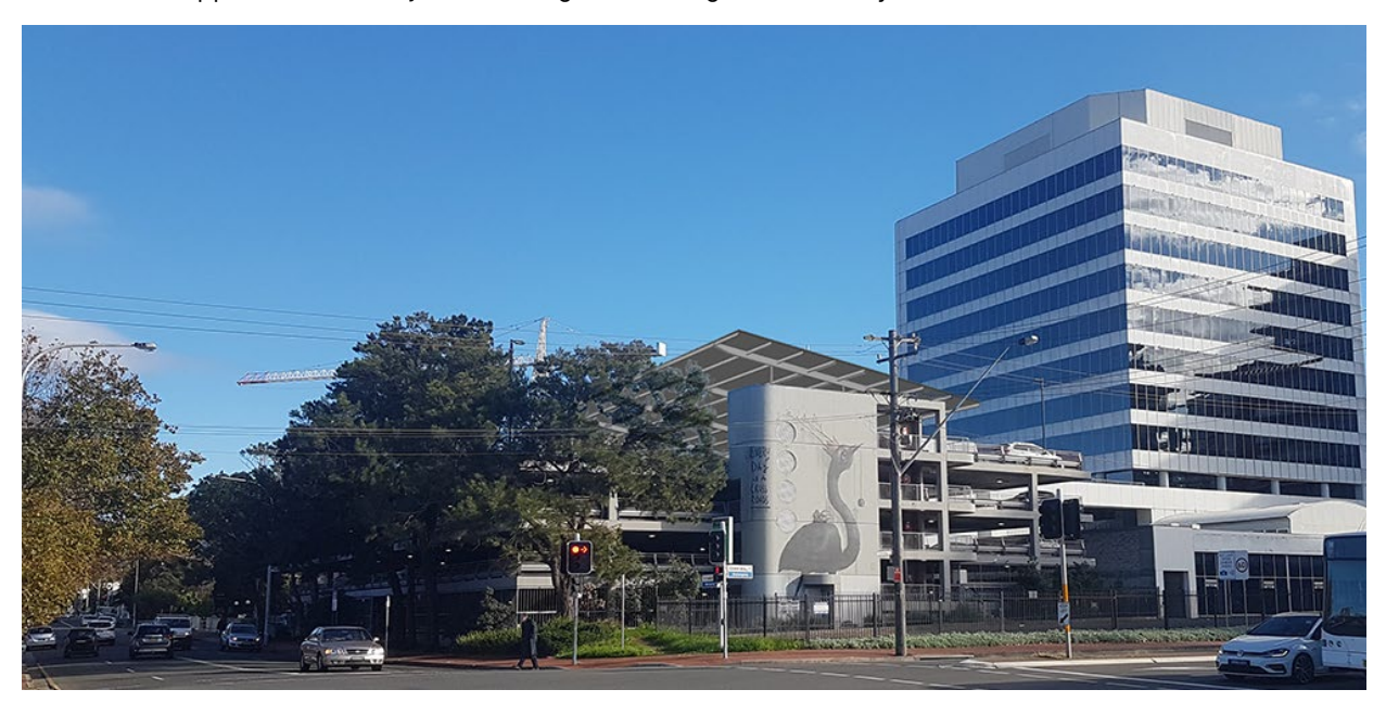
[IMAGE: Council's Administration Car Park Solar Project, Stewart Street Wollongong]

Council continued to provide technical support to lease and licence holders with regards to sustainability improvements including the installation of proposed photovoltaic system and value/performance, structural suitability/permissibly, life expectancy, electrical and mounting methodology. Council's engagement with industry leaders such as the Green Building Council of Australia and research institutions such as the University of Wollongong (UoW) allows for cross organisational knowledge sharing and capacity building. Council is also working with the UoW to support the delivery of the Integrated Design Studio subject.