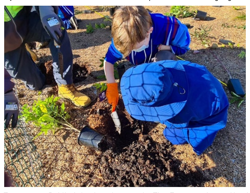
[IMAGE: Tarrawanna Public School students at the Tiny Forest project at Harrigan Park]

The next stop for our tiny forest will be Dimond Bros Park at Dapto and the Wollongong Botanic Garden.