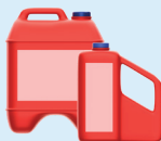
Motor oils, fluids and fuels