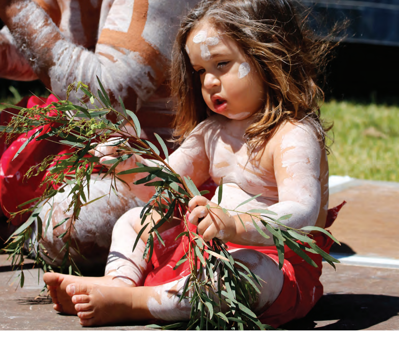
Image: Aboriginal Smoking Ceremony, Viva la Gong Festival, Wollongong