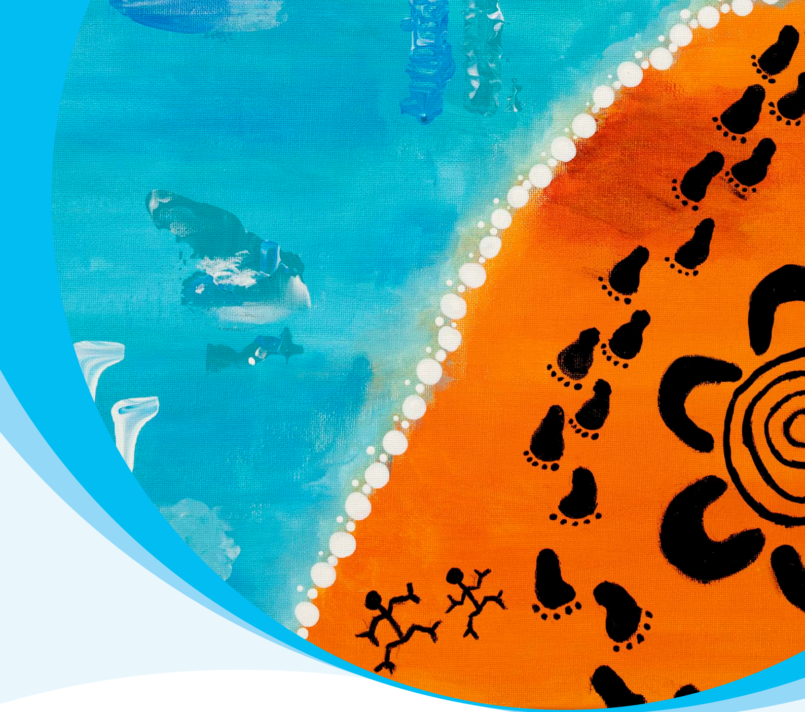
Image: Artwork by Claire Harding, Acknowledgment of Country Art Competition 2022